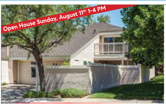
516 Adirondack Way, Walnut Creek Offered at $859,000

See public meetings schedule on this pages and check online for agendas, meeting notes and announcements Town of Moraga: www.moraga.ca.us Phone: (925) 888-7022 Chamber of Commerce: www.moragachamber.org Moraga Citizens' Network: www.moragacitizensnetwork.org