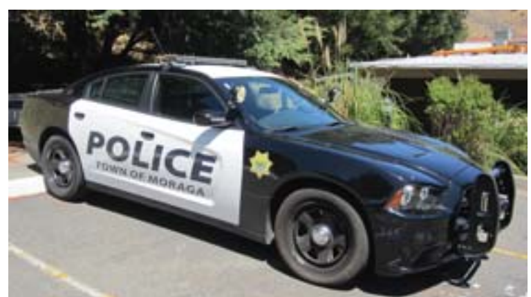
Moraga Police Department's Dodge Charger