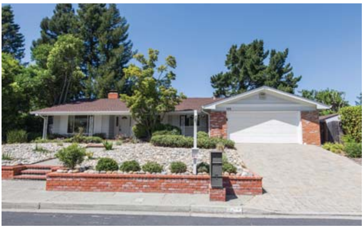
125 Hazelwood Place, Moraga | Offered at $1,295,000

This fabulous single-story rancher offers stunning natural light and an open floor plan on a highly sought-after cul-de-sac with a flat lot. Location, Location, Location! Convenient to nearby parks, trails, schools, shopping, Farmer's Market and public transportation.